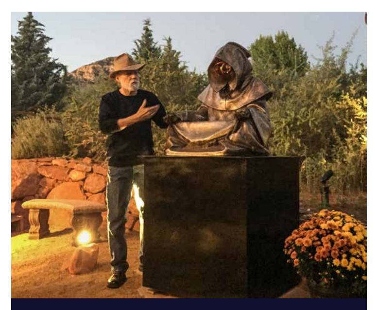
"The Holy Grail" – Lifesize (19" high maquettes available)