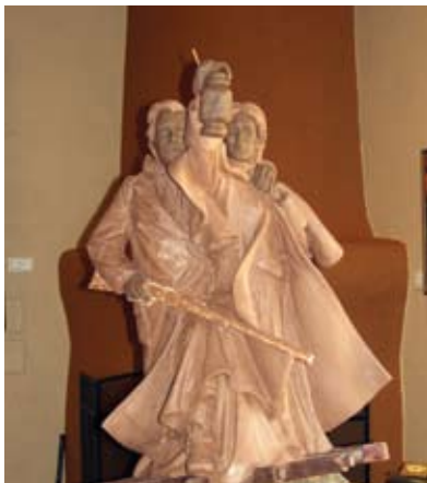
"The Lighted Lantern" Clay In-Progress (24" high)