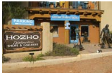
Hozho Plaza/Sedona Crimson Shadows Gallery/Working Studio