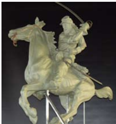
"The Last Horseman" Clay In-Progress (38" high)