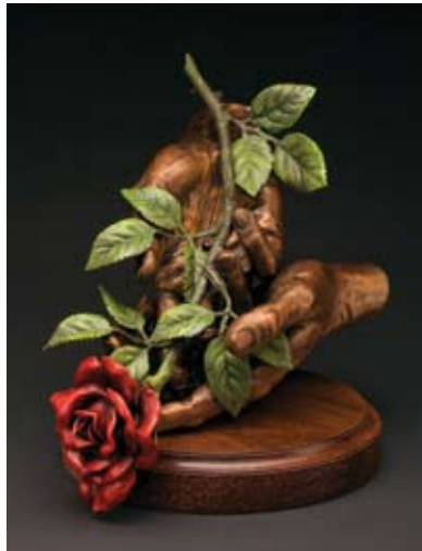
"The Gift" 9" x 11" Ed.33