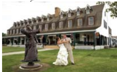
"The Dance" (7 ft. high Ed.12) Sheridan, Wyoming