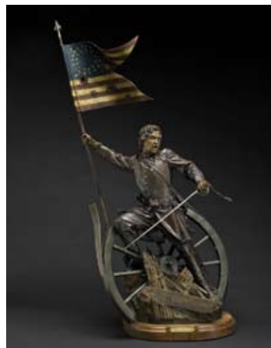
"Cry Freedom" 40" high Ed.24