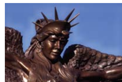
"Caduceus" 12 ft monument Ed.12 and 14" high studies