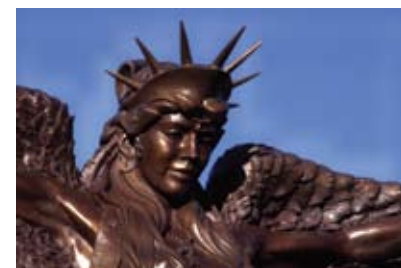
"Caduceus" 12 ft monument Ed.12 and 14" high studies