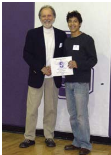
James Muir/Stephan Herrera Human Liberty Art Award