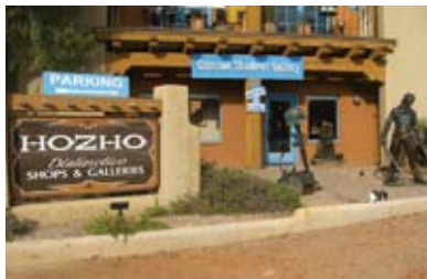
Hozho Plaza/Sedona Crimson Shadows Gallery/Working Studio