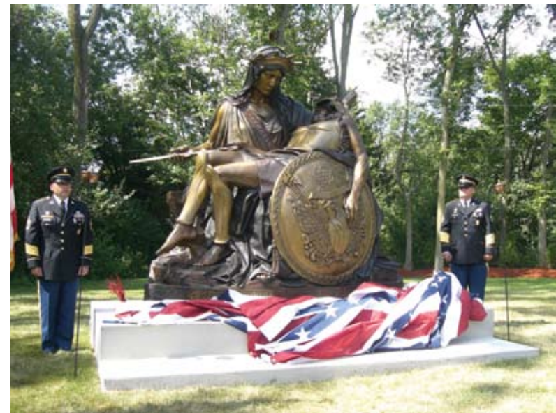
"The American Pieta" 9 ft. monument and 17" maquettes - Dedication/Unveiling-Lake Forest, Illinois

His book " Lanterns Along The Path " and recent works continue to address those concepts.