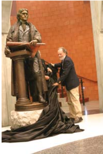
"Thomas Jefferson-1802" Dedication/Unveiling West Point Jefferson Hall Library (23" Maquettes available)

website: www.jamesmuir.com e-mail: info@jamesmuir.com phone: 928/284-3123 cell: 520/991-9147