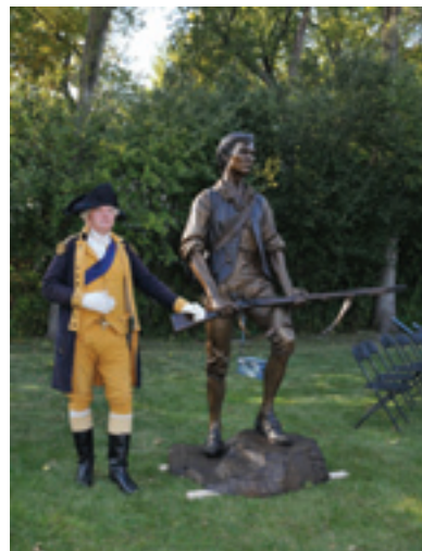
"Sons of Liberty-1775" with George Washington Dedication Lake Forest, Illinois