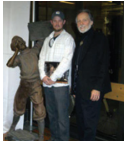
University of Arizona Dedication and Scholarship Award