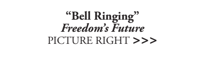
"Bell Ringing" Freedom's Future PICTURE RIGHT >>>