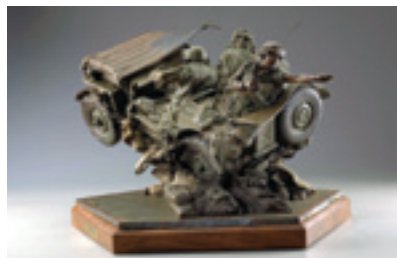
"Band of Brothers"