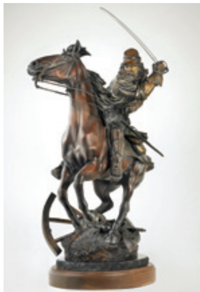
"The Last Horseman" (40" x 18" x 27")