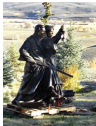
"The Lighted Lantern" Lifesize @ Gunnison, Colorado BOTTOM RIGHT >>