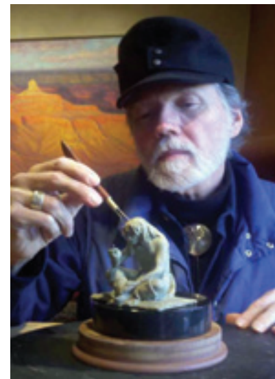
"Visions of The White Man's Road" Commissioned Study Size for Sedona Arts Center