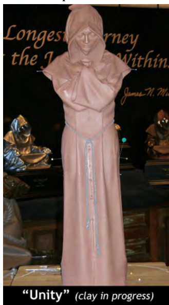
“Unity” (clay in progress)

Also in-progress is “ Athena's Prayer ”, a patriotic, female