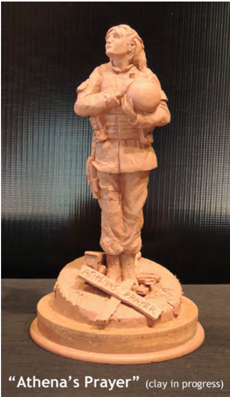
"Athena's Prayer" (clay in progress)