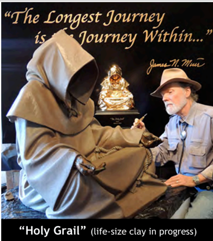
“Holy Grail” (life-size clay in progress)