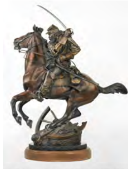
"The Last Horseman" (only 2 left in Edition)

We have a few sculptures that are almost sold out, one of the recent most popular has been " The Last Horseman " and has only 2 left ... Do call or write if you would like to reserve one of these.