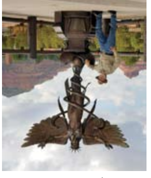
J.N. Muir Studios 295 Pinon Woods Drive Sedona, AZ 86351