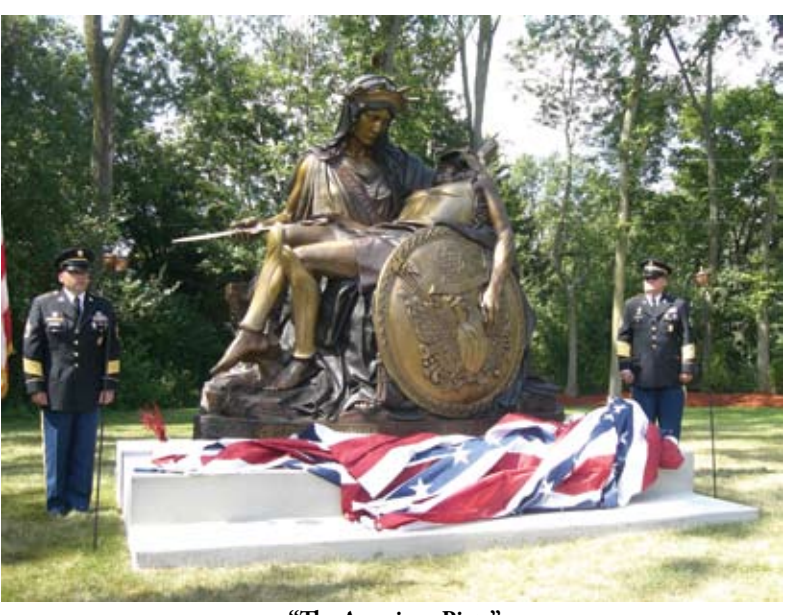
"The American Pieta" 9 ft. monument and 17" maquettes - Dedication/Unveiling-Lake Forest, Illinois