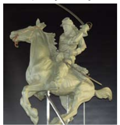
"The Last Horseman" Clay In-Progress (38" high)

Our summer schedule is busy with the Loveland Sculpture Show in Colorado which we participate in each year. It is a "must see" show for collectors with hundreds of artists and sculptures!!! We hope to see you there this year, August 7,8,9.