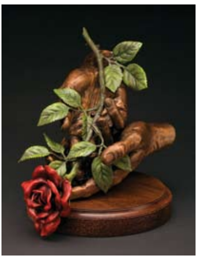
"The Gift" 9" x 11" Ed.33