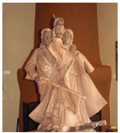
"The Lighted Lantern" Clay In-Progress (24" high)

We are taking maquette reservations for these now.