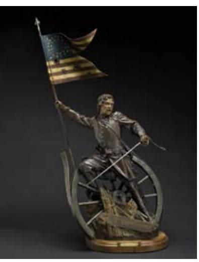
"Cry Freedom" 40" high Ed.24